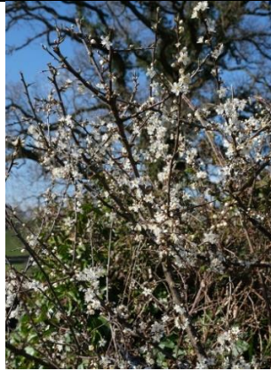
Blackthorn (Sloe) Prunus spinosa Flowers before Mayflower (Hawthorn)