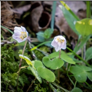
Wood Sorrell Oxalis acetosella Very attractive small flowers