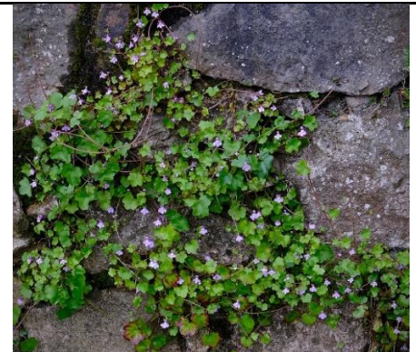
Ivy leaved toadflax Cymbalaria muralis Common on walls/ kerbsides