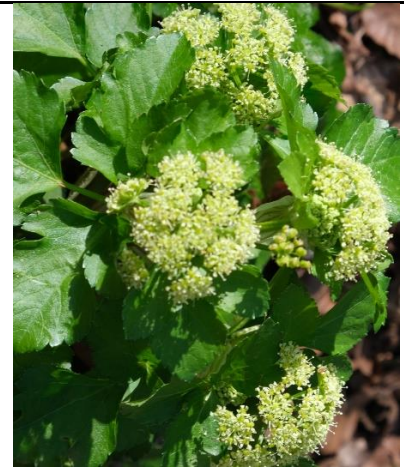
Alexanders Smyrnium olusatrum Big and bushy, common on roadsides