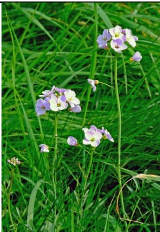
Lady's Smock Cardamine pratensis Found in a few grassy places