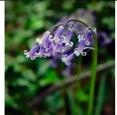
English Bluebell Hyacinthoides non-scripta Also Spanish varieties (more upright) and hybrids. Sometimes white