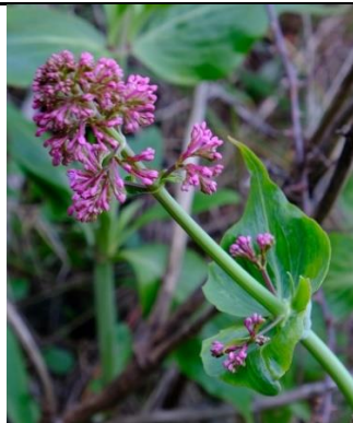
Red Valerian Centranthus ruber Common along roadsides/hedges