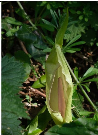
Cuckoo-pint Arum maculatum Common in shady places